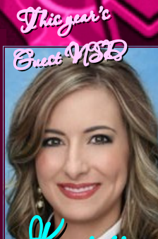
This year's Guest VSD