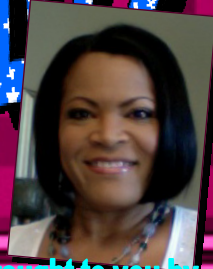
brought to you by