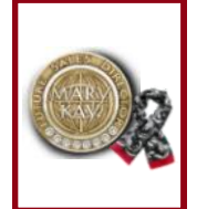
Your Name Here! DIQ