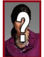
Your Name Here!