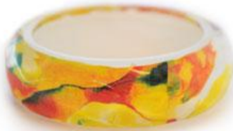
Way to Grow Luncheon bonus bracelet

The challenge continues! Sales Directors and Consultants can be rewarded during You Can Do It! SM Career Conference 2012 for unit growth. Rewards are based on increasing the unit's size by 10 percent each month from Dec. 1, 2011 – Feb. 29, 2012.