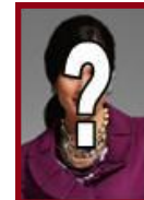
Your Name Here!